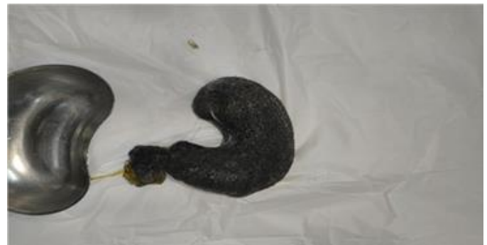
Figure 3: Specimen showing Trichobezoar same as size of kidney tray weighing 850gram

bowel and large bowel. Adhesion was found on distal ileum for which adhesiolysis was done. Inflamed appendix was found and appendicectomy was done. Necrosed omentum was present and tip of necrosed omentum was removed. Jejunum- Jejunum intussusception which was 15-20cm from Duodeno-jejunal junction was reduced. Incision was made over stomach and Trichobezoar was removed which was 8cm in diameter and 30cm in length and 850gram in weight. Stomach closure was done. Drain was placed on right side of the pelvis and abdominal closure was done. Dressing was applied and patient shifted to recovery room. No post operative complications were noted.