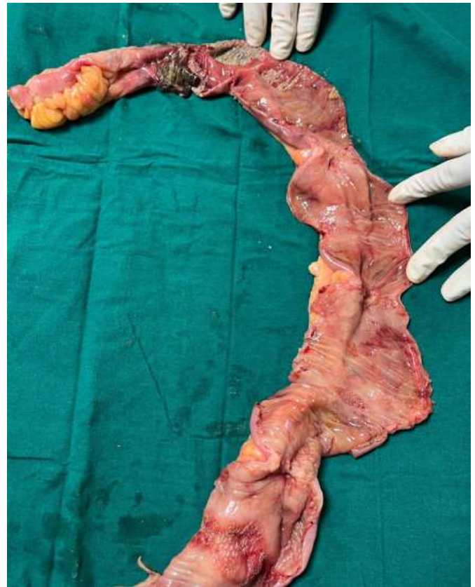
Figure 6: Resected segment showed transmural ischemic changes, ulceration and features of chronic ulcerative colitis.

Proximal end of the Jejunal stump was closed and an end to side ileojejunostomy was done. Open lower midline wound was closed in layers. Obturator defect was closed with 2-0 prolene. Thorough wash given and port sites were closed.