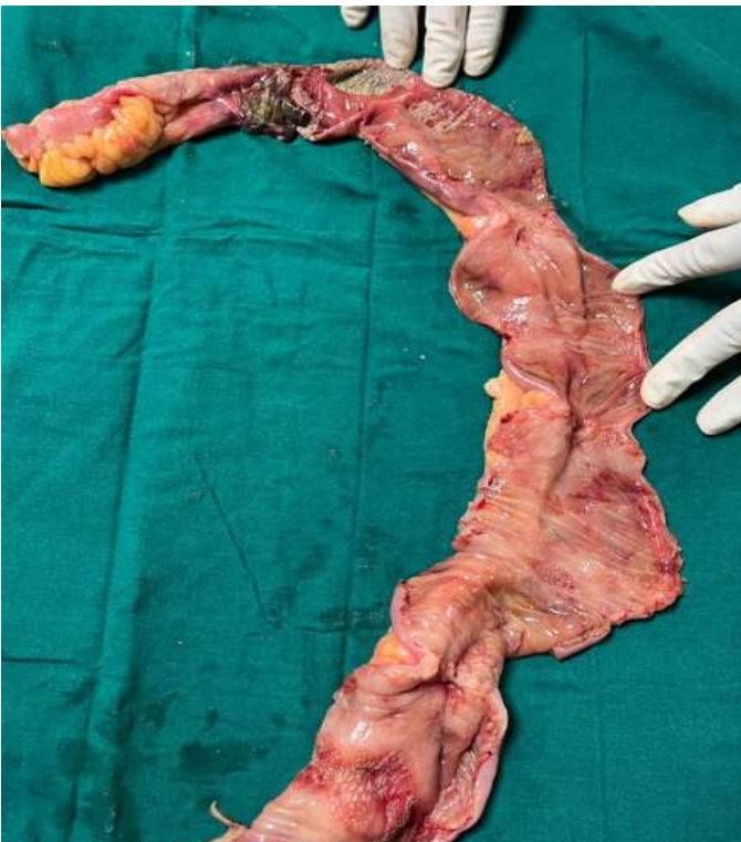
Figure 5: Resected segment of small bowel

Infra umbilical incision was made and bowel was delivered. 40cm of small bowel, including the gangrenous segment and adjacent strictures, was resected. (Fig-5).The resected segment showed transmural ischemic changes, ulceration and features of chronic ulcerative colitis (Fig-6)