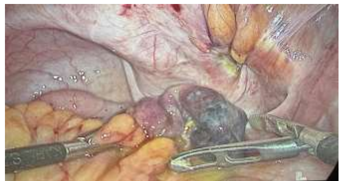
Figure 3: Intraoperative laparoscopic picture showing the gangrenous segment

Routine blood investigations showed anemia, hence she was transfused with unit PRBC pre operatively and she was taken up for Diagnostic Laparoscopy. After the peritoneal cavity was entered, right obturator hernia with gangrenous mid ileum as content was noted with Dilated proximal bowel loops and collapsed distal bowel loops. Multiple strictures were noted proximal to the obstruction. (Fig-3, Fig-4)