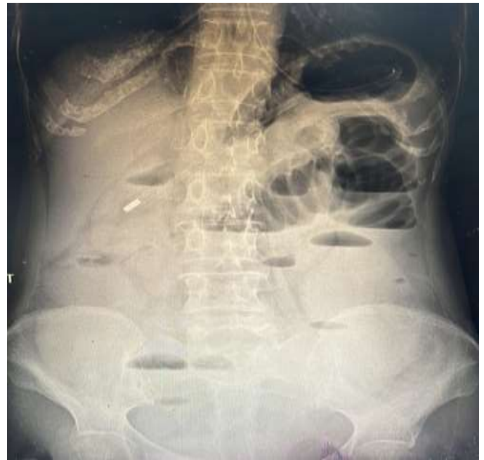
Figure 2: X-ray abdomen erect with multiple air-fluid level

Routine blood investigations showed anemia, hence she was transfused with unit PRBC pre operatively and she was taken up for Diagnostic Laparoscopy. After the peritoneal cavity was entered, right obturator hernia with gangrenous mid ileum as content was noted with Dilated proximal bowel loops and collapsed distal bowel loops. Multiple strictures were noted proximal to the obstruction. (Fig-3, Fig-4)