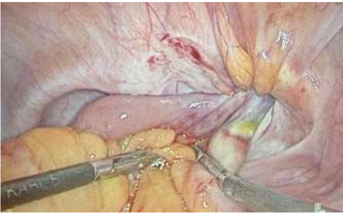
Figure 4: Intraoperative laparoscopic picture showing the site of hernia

Infra umbilical incision was made and bowel was delivered. 40cm of small bowel, including the gangrenous segment and adjacent strictures, was resected. (Fig-5).The resected segment showed transmural ischemic changes, ulceration and features of chronic ulcerative colitis (Fig-6)