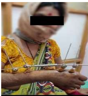
Post Operative Clinical Photo