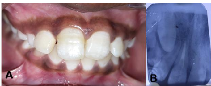
Figure 2: At six months follow up. A- Clinical image, B- Radiographic image