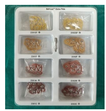
Figure 3:Sof-Lex System DiscsFig