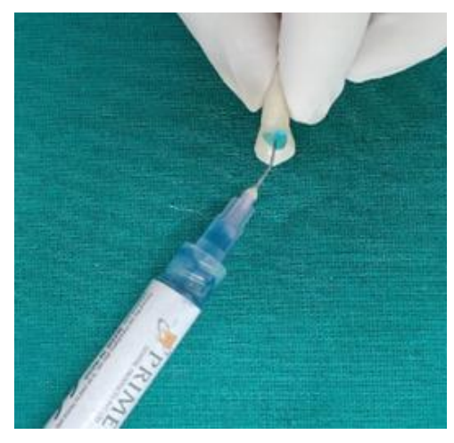
Figure 7: Application of Etchant