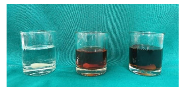
Figure 15: Immersion of the polished samples