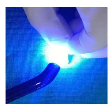
Figure 9: Light Curing for 20s