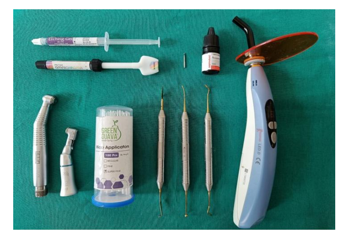
Figure 5: Armamentarium Used