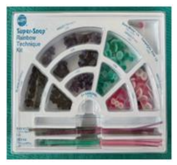
Figure 4: Super- Snap Rainbow Technique Kit