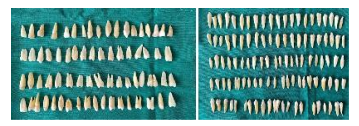
Figure 1: Sample Collected for the Study