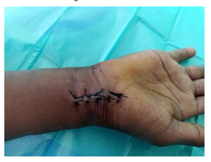
Figure 6: Post-operative scar

Postoperative follow-up was conducted every three months (figure 6) the patient expressed her gratitude that there was no deformity or numbness that might occur in preoperative communication. The patient made a full recovery without significant swelling and restricted movement. The flexion and extension of the wrist joint painless and non-restricted there was no clinical and radiologic evidence of recurrence.