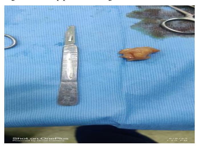
Figure 4: Intraoperative dissection photo

Histopathologic examination showed that the tumour was lobulated and multinucleated giant cells scattered within monomorphic stroma, nuclei of giant cell are similar to stromal cells, there is no evidence oof malignancy (Fig. 5). Histopathology suggested that these masses were consistent with GCTTS without malignancy