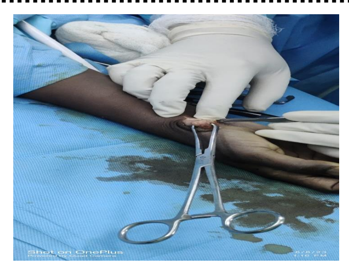
Figure 3: Intraop photo showing tumour