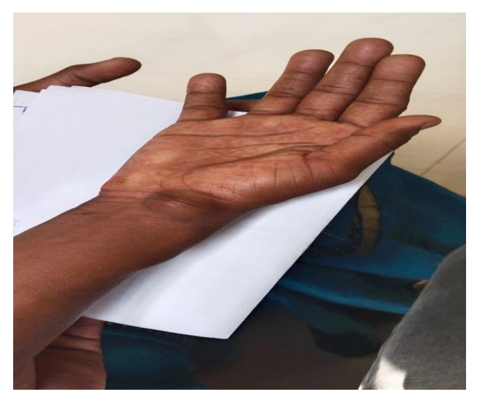
Figure 1: Clinical picture of right wrist showing swelling

X-ray examination of the right wrist showed a mass shadow with normal underlying bone. The FNAC report was suggestive of sections showing a tumor composed of multinucleated giant cells scattered within a monomorphic stroma; the nuclei of the giant cells were similar to those of the stromal cells. The patient was taken for elective surgery after due pre-operative evaluation and was given regional anesthesia (supraclavicular block) before the procedure.