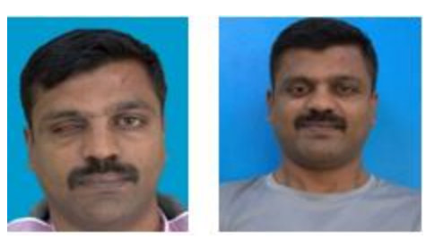
Fig. 3: Pre and post op

Case 2: A 58-year-old male reported post enucleation of his left eye due to trauma while working on a field. Impression of affected eye was made using light body addition silicone, scleral try in was done to achieve the desired contour. Centering of iris was done and aluminium disc placed in position of future iris. Iris disc was chosen and trimmed to the diameter of patient's normal iris. Iris painting was done using acrylic colours and paint brushes of size 0,00 and 000 (fig 4). Painted iris disc was replaced in place of aluminium disc after dewaxing. Scleral acrylic was packed and heat cured (fig 5). The sclera was characterized using acrylic paint, finished, polished and delivered to the patient (fig 6).