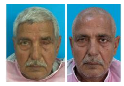
Fig. 8: Pre-op and post op Discussion

The iris, with its intricate structure and precise functionality, is truly a remarkable feature of the human eye [5]. Replication of the iris holds significance in the process of fabricating an ocular prosthesis that must contribute both emotional and physical motivation to the patient. In this case series, to achieve precise iris replication three distinct techniques were employed like the utilization of stock eyes, the meticulous art of hand painting, and the employment of digital photography.