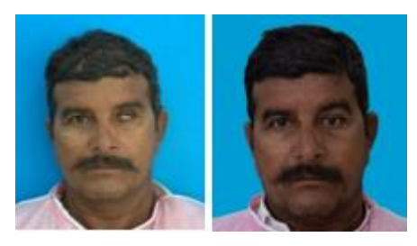
Fig. 6: Pre and post op

Case 3: A 65-year-old male who underwent evisceration post trauma of his left eye reported for fabrication of prosthetic eye. Impression was made using light body addition silicone, scleral try in was done using modeling wax followed by iris centering. Photograph of the patient's normal eye was captured using DSLR camera (Canon 1300D) using an ISO of 100, aperture size of F22, Focal length of 1.5 feet and using white balance. Digital print of the same was made on polished vinyl sticker sheets after editing the diameter of the iris using appropriate computer software (fig 7). The iris was removed from the printed sheet and stuck on iris disc, upon which iris button was placed using monopoly syrup. The aluminium disc used for iris centering was removed post dewaxing and replaced by the corneal button before packing. The processed prosthesis was characterized, finished, polished and delivered to the patient (fig 8).