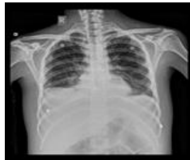
Figure 3: Chest radiograph demonstrates bilateral diffuse perihilar and basal air-space opacities with mild bilateral pleural effusion.