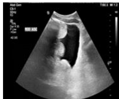
Figure 2: Ultrasound abdomen demonstrates moderate volume ascites with internal echogenic debris, suggestive of complex (exudative) ascites.